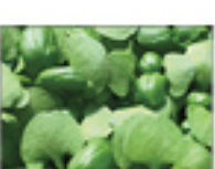
Genovese Basil 10779