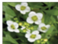
Sweet Alyssum 13472