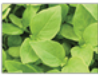
Lemon Basil 10795