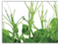
Frilly Pea 10826