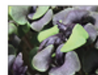
Opal Basil 10883