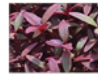
Garnet Amaranth 10780