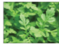
Citrus Lace 10843