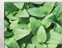
Thai Basil 11299