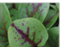
Red Veined Sorrel 10895