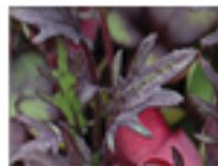
Burgundy Kale 11702