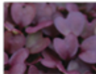
Crimson Mustard 11666