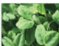
Pea Shoots 10781