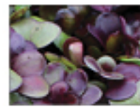
Purple Radish 10924