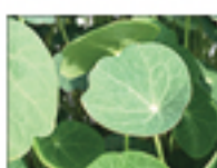
Empress of India Nasturtiums 11151