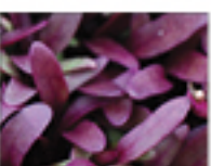
Bull's Blood Beet 12058