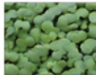
Wasabi Mustard 10873