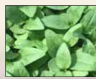
Thai Basil 11299