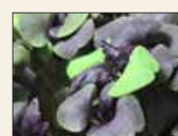
Opal Basil 10883