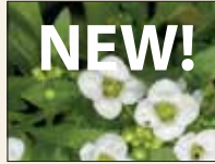
Sweet Alyssum 13472