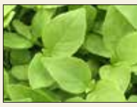
Lemon Basil 10795