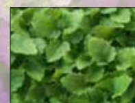
Lemon Balm 10971