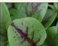
Red Veined Sorrel 10895