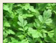
Citrus Lace 10843