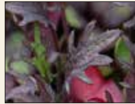
Burgundy Kale 11702