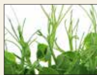
Frippy Pea 10826