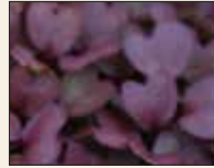
Crimson Mustard 11666