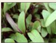
Rainbow Chard 12060