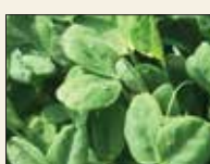
Pea Shoots 10781