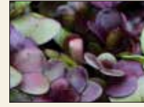
Purple Radish 10924