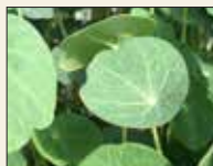
Empress of India Nasturtiums 11151