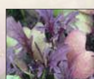
Ruby Streak Mustard 10797