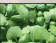
Genovese Basil 10779

GREENLEAF Providing Ingredients that Matter